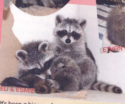
ELI & ESMIE