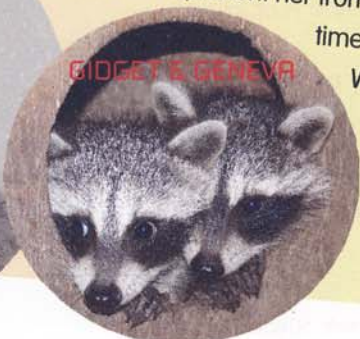
GIDGET & GENEVA