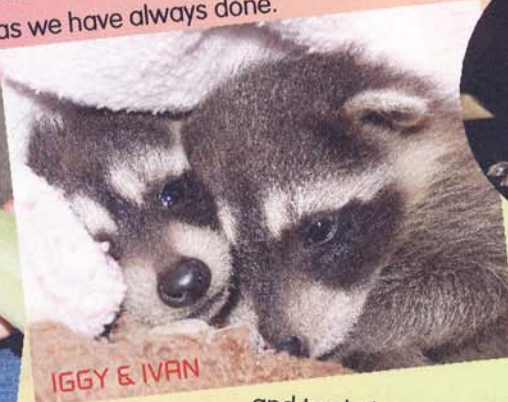
IGGY & IVAN