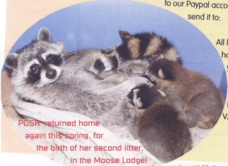
POSH returned home again this spring, for the birth of her second litter, in the Moose Lodge!

It's been a big year for raccoons and also for donations, though they did not quite double in quantity, as the raccoons did! Although licensed by the state of Virginia, Dogue Hollow does not receive any compensation for our work from the state, or any other organization, though we do receive some medical supplies from the Wildlife Rescue League, based in falls Church. For everything else, we depend totally on the generosity of folks like yourself and, without your help, there would be no sanctuary. For those who already support our efforts, we thank you and hope we can continue to count on you in 2010. For those of you reading our newsletter for the first time, I hope our little guys photos have tugged at your heart strings, and that you will help us in 2010 and beyond. We have T-shirts and other gifts, free with donations of certain amounts, displayed on our web site at: www.doguehollowwildlifesanctuary.org , where you will find a direct link to our Paypal account, for your convenience. If you prefer to mail your donation, please send it to: Dogue Hollow Wildlife Sanctuary, POB 895, Lorton, VA 22199.