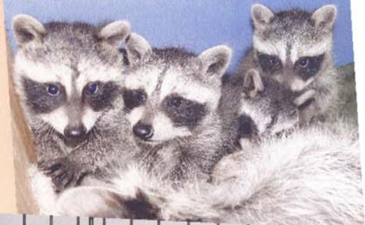
Emmy with her kids - Elvis, Ernie, Wee Willie and Elsa

Venus (released in '06) also came home and managed to squeeze back into one of the enclosures, where she then gave birth to three! And stayed for three months!