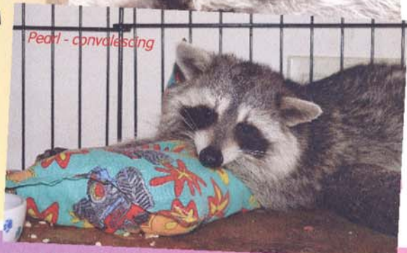
Pearl - convalescing

Venus (released in '06) also came home and managed to squeeze back into one of the enclosures, where she then gave birth to three! And stayed for three months!