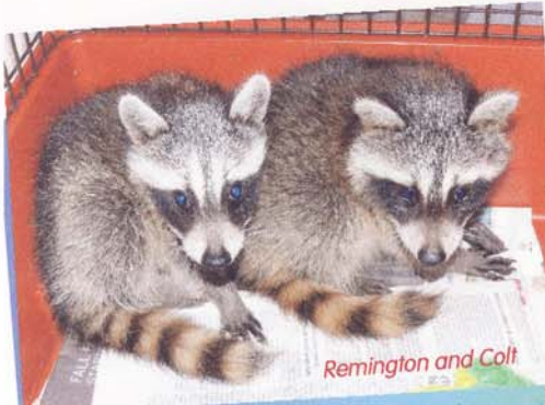
Remington and Colt

16 July - The Stone Family - Amber, Jade, Opal & Jet. Eyes just open. They also caught the virus and Opal quickly succumbed. Due to quarantine, this family and all that followed, have had to stay in our care for longer than usual, so they are still with us, but, weather permitting, should be released before year's end.