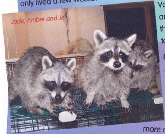
Jade, Amber and Jet

Pearl, bless her heart, gave me many sleepless nights this spring. In March she arrived one night for dinner, obviously ill. I was able to scoop her up and immediately whisked her off to a cage. She was extremely sick with high fever and infected wounds, probably bites. After several visits to the vets and lots of antibiotics she was getting better when she developed pneumonia. More antibiotics, lots of TLC, and she miraculously recovered, so that in May I was able to re-release her! She now visits every evening for more of the treats she enjoyed while she was sick.